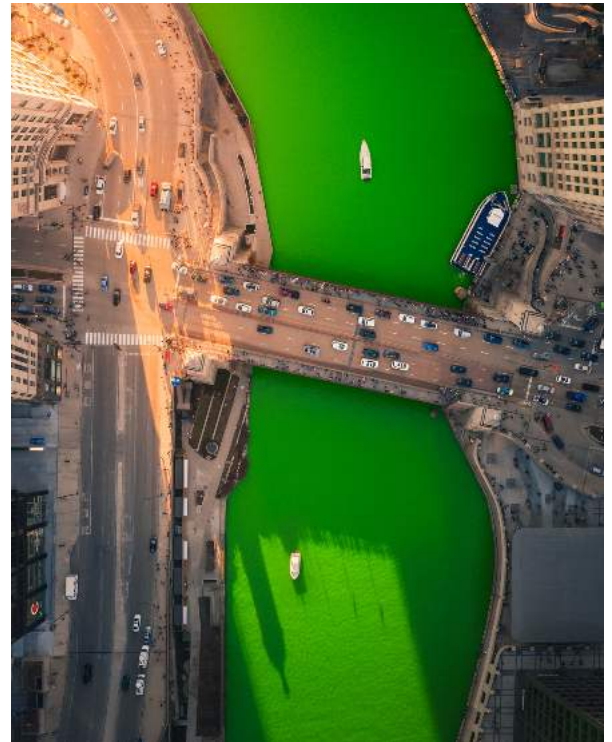
The Chicago river dyed green for St. Patrick's Day