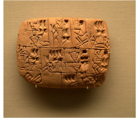
Pictographs Recording the Allocation of Beer, Public domain

"India Ink" is a type of ink that was actually invented in China. It's unclear exactly when it first came into use, but some historians put its earliest use sometime around 3,000 BC. The ink is a mixture of hide glue, carbon black, lamp black, and bone black pigment.