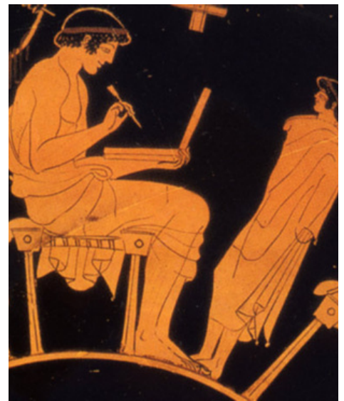
Douris Man with wax tablet, public domain.