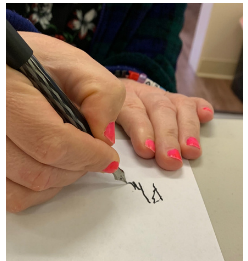
Phoebe tries out a modern fountain pen.