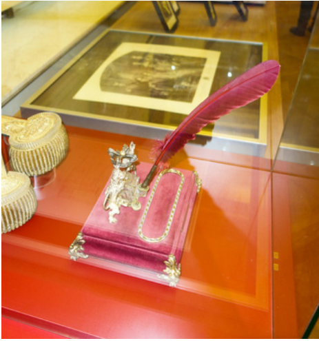
"Royal quill pen"

These materials are mixed together and ground up with a mortar and pestle to create the inky paste. The invention of ink allowed people to write relatively easily on bones, stones, bamboo, and wooden tablets. The convenience of writing with ink on top of a surface rather than carving into it meant people could write more quickly and easily. This meant more ideas were finding their way into the world. Good deal!